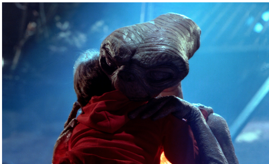
E. T. the Extra-Terrestrial ™ & © Universal Studios