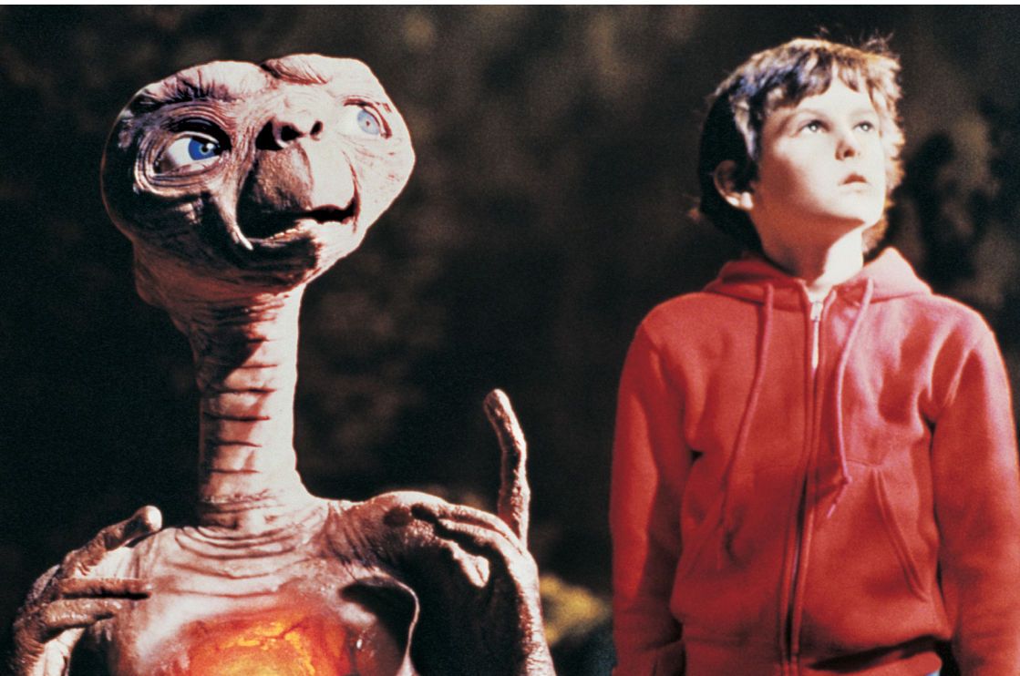
E. T. the Extra-Terrestrial™ & © Universal Studios